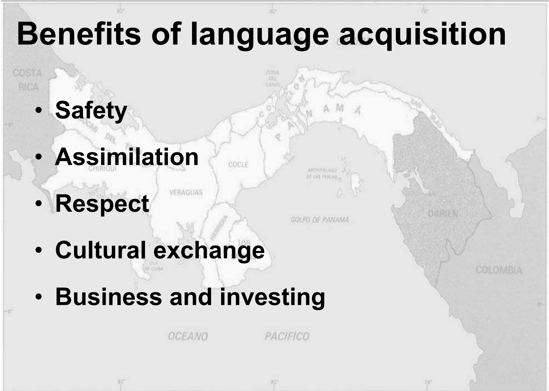
Location of the Darien Region, Panama