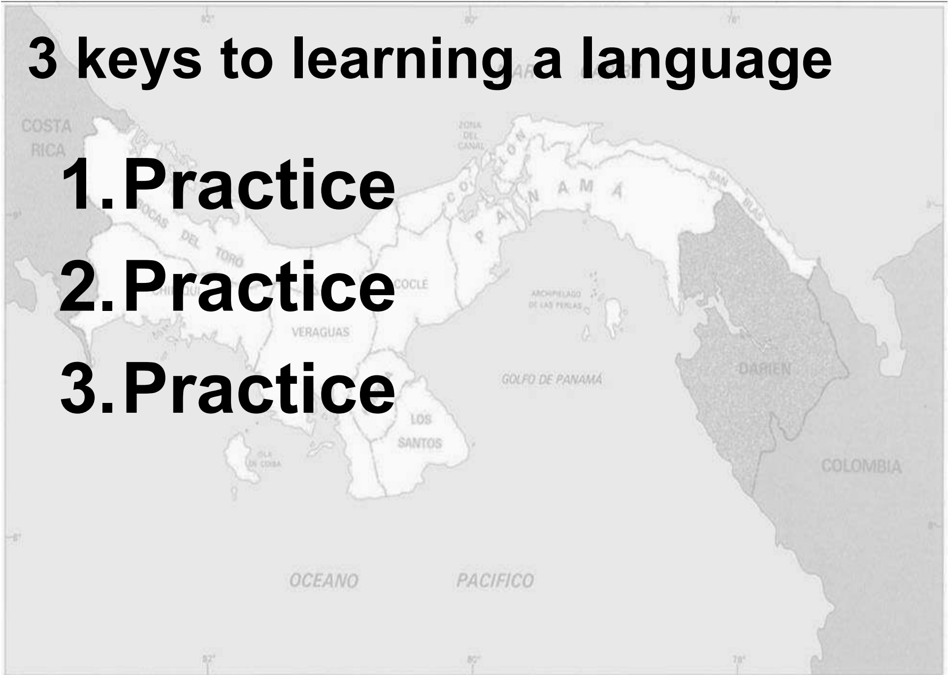
Location of the Darien Region, Panama