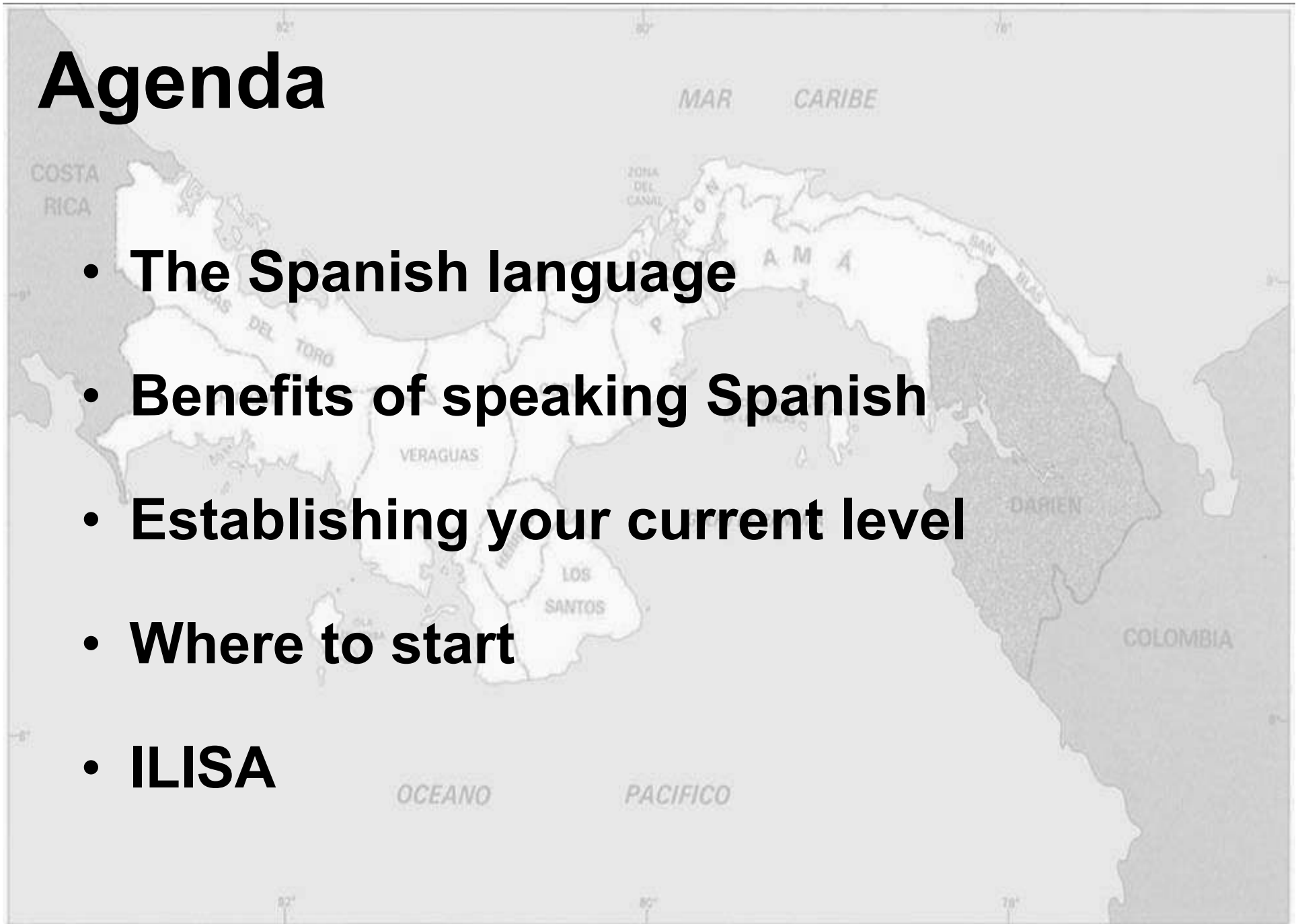
Location of the Darien Region, Panama